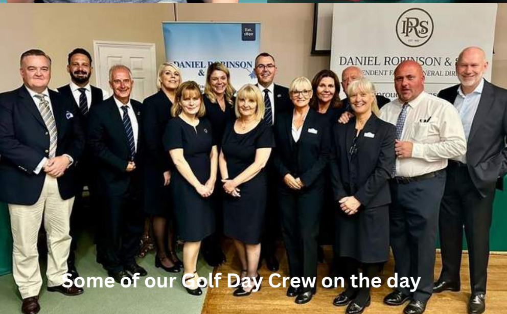
Some of our Golf Day Crew on the day